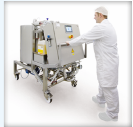
The mobile CIP unit is easy to move from one process installation to another.

You can also ensure that the mobile CIP unit is configured to recirculate the cleaning agents, resulting in an even lower level of consumption.