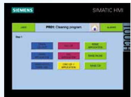
Via the control panel, you can quickly select the appropriate cleaning programme, each of which consists of several steps. Within each step, the available parameters (time, CIP tank volume, temperature, conductivity, etc.) can be flexibly adjusted.