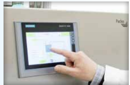
The intuitive control panel makes it easy to use the unit.